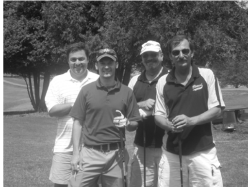
Jack Nicklaus: Integrys Energy Services of NY shown with Besroi Construction