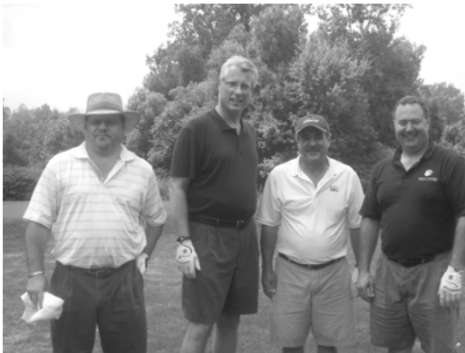
Ben Hogan Eagle Systems, Inc.

Jack Nicklaus: Bank of Akron Sheridan Benefits, LLC.